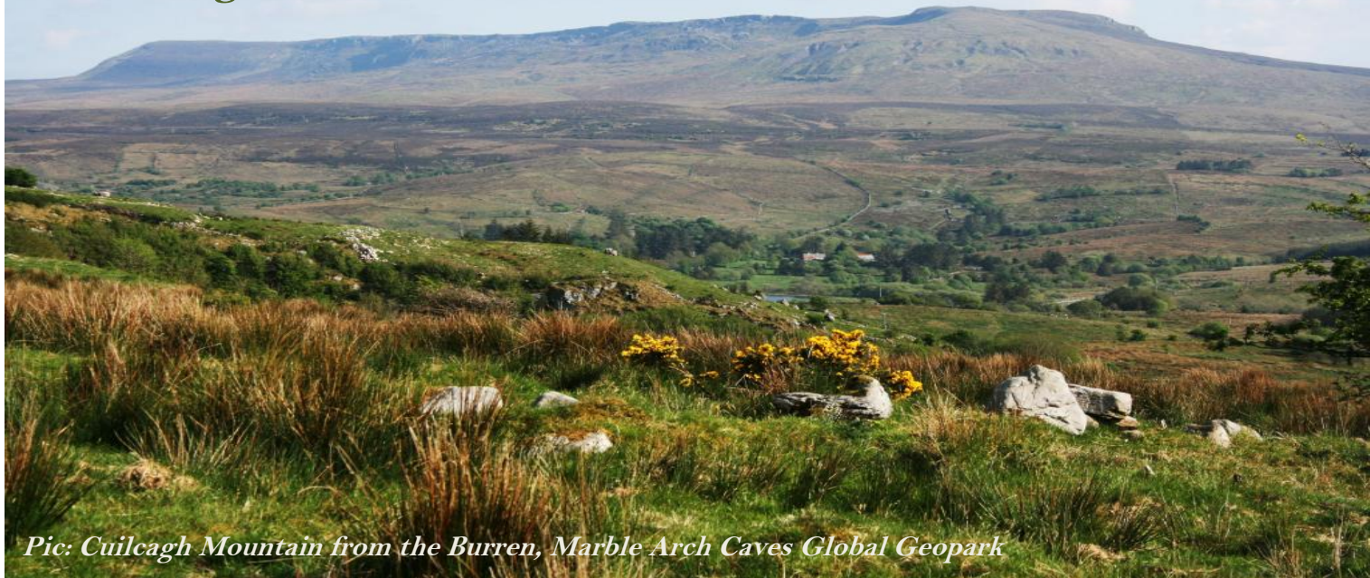
Pic: Cuilcagh Mountain from the Burren, Marble Arch Caves Global Geopark